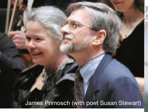
Pictured on this spread: a sampling of composers who have new works scheduled for world premieres by American orchestras during the 2009-10 season.